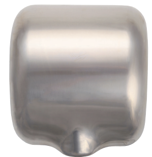
Satin Stainless Steel