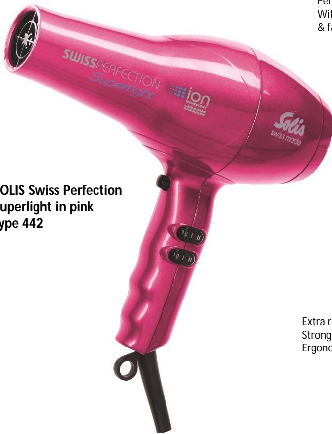
SOLIS Swiss Perfection Superlight in pink type 442

Only 240g light, for tireless work Perfectly balanced ergonomic grip With ION-Technology for smooth, shiny hair & fast drying