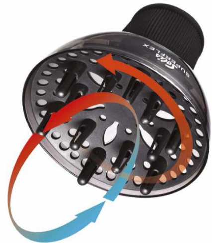
SOLIS Hair Dryer Nozzle - Softstyler Superflex

Perfect hair style due to adjustable air flow Very robust, if it should fall to the ground no cracks No scratches on the hair dryer, thanks to soft rubber linings