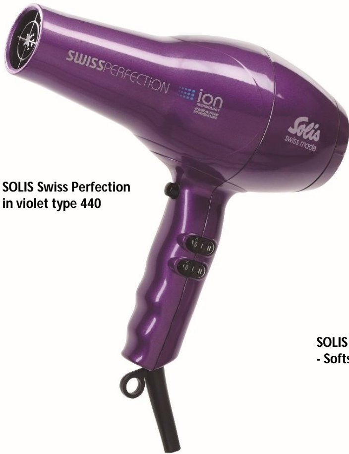
SOLIS Swiss Perfection in violet type 440