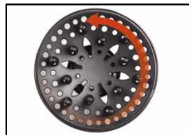
Diffuser disc regulates the airflow