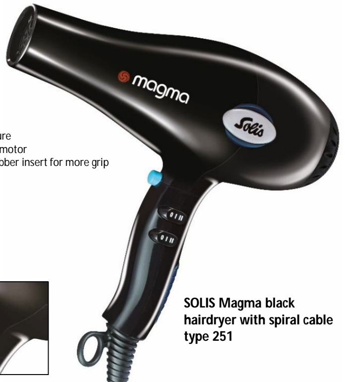
SOLIS Magma black hairdryer with spiral cable type 251