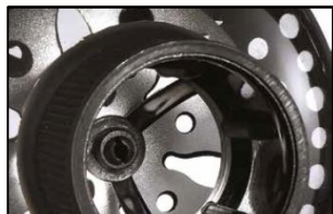
Soft rubber linings against scratches on the housing

Perfect hair style due to adjustable air flow Very robust, if it should fall to the ground no cracks No scratches on the hair dryer, thanks to soft rubber linings