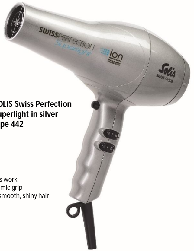
SOLIS Swiss Perfection Superlight in silver type 442