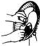
STEP 4. 5.